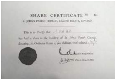
Fig. 11 Copy of one resident's share certificate.