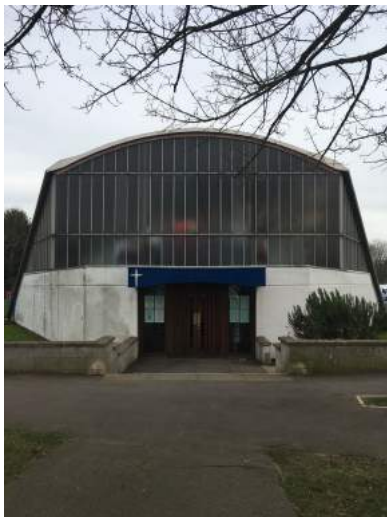
Fig. 1 View of the entrance to the Church of St John on the Ermine Estate.