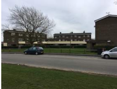
Fig. 3 Red brick blocks of flats on the Ermine Estate.

Still one of Lincoln's largest council estates totalling around 1350 homes, split into East and West components by the existing Riseholme Road (part of the Roman 'Ermine Street'), the Ermine Estate formed the final phase of the local authority's housing construction for the period, mainly constructed between 1952 and 1958 (Harwood, 1999).