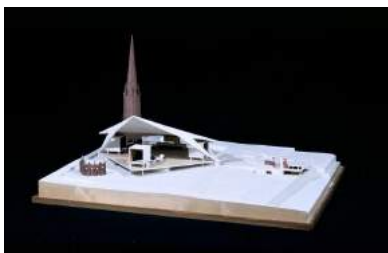
Fig. 2 Physical model of the Smithson's Coventry Cathedral competition entry.

‘How could the relation of man to God be better expressed, we feel now justified in asking, than by building the house of God in accordance with the fundamental geometry of square and circle.’ (Wittkower, 1949)