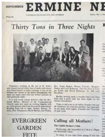
Fig. 14 The congregation appearing in the Ermine News after removing 30 tons of earth from the site.

male members of the congregation appeared at the entrance of the building at the request of the vicar '[...] to decorate, make cupboards, complete the site works and many other jobs to be ready for Consecration Day, October 6 th .' (Hodgkinson, 1963)