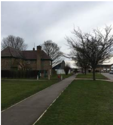
Fig. 4 View of the Vicarage with the Church of St John in the background.

Still one of Lincoln's largest council estates totalling around 1350 homes, split into East and West components by the existing Riseholme Road (part of the Roman 'Ermine Street'), the Ermine Estate formed the final phase of the local authority's housing construction for the period, mainly constructed between 1952 and 1958 (Harwood, 1999).