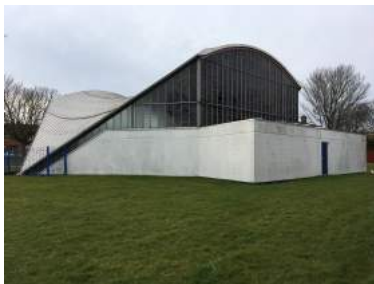
Fig. 10 View of the Church of St John from the South-East showing the undulating roof design.