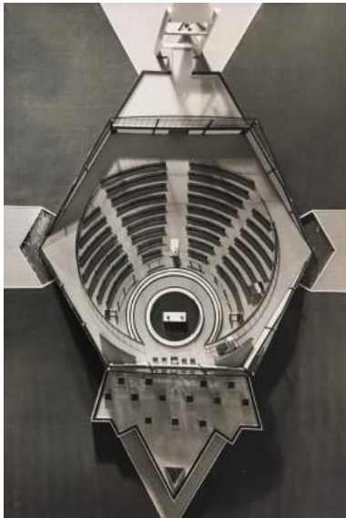
Fig. 5 Physical model of Scorer's hexagonal plan for the Church of St John. The model was later sat on and subsequently destroyed by a member of the congregation.

Referring to this early meeting between Scorer and Hodgkinson, current vicar Stephen Hoy explained how the exchange eventually informed a 'hexagonal solution to the question of the new liturgy' (Elain Harwood, 2015), including the final arrangement of the 'primitive' (Nikolaus Pevsner, 1989) concrete font, pulpit and alter (Fig. 5). He states that the former marks '[...] the geometric centre point for the hexagonal portion of the church in every direction' (Hoy, 2018), while the pulpit stands to the North and the alter offset to the East (Fig. 6).