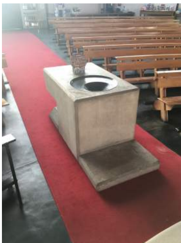
Fig. 6 Cast concrete font marks the centre point for the church.