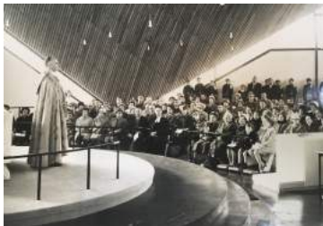
Fig. 15 The congregation enjoying their completed church.

On Tuesday's and Thursday's, the main work nights, women and children were also requested on site, 'Apart from providing cups of tea, there is needlework to be done [...]' (Hodgkinson, 1963). In three of these evenings, along with the help of Rev. Frank Baker, volunteers from the congregation removed '[...] thirty tons of earth with shovel and wheel-barrow [...]' (Hodgkinson, 1963), a mark of their dedication (Fig. 14).